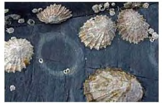
LIMPET, Acmaea mitra