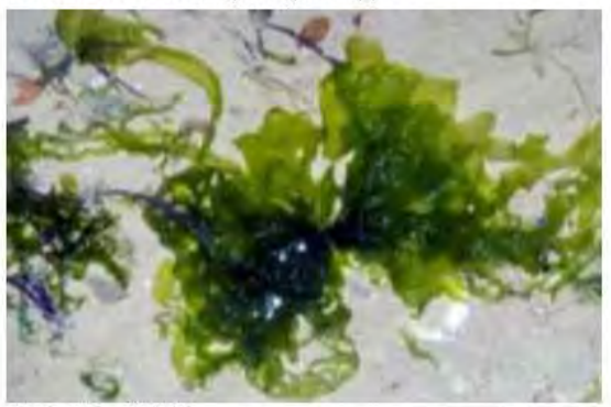
SEA LETTUCE, Ulva lactuca