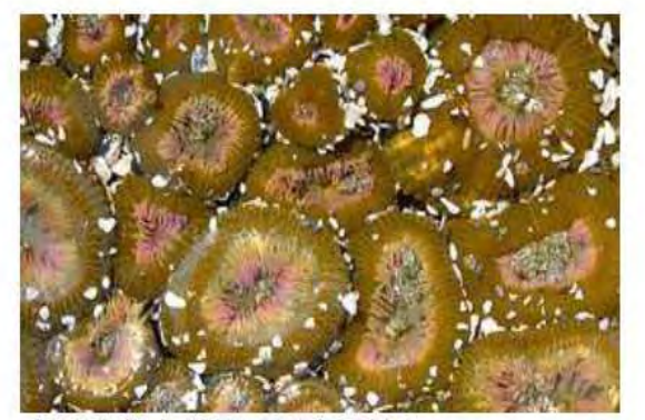
AGGREGATING ANEMONE, Anthopleura elegantissima