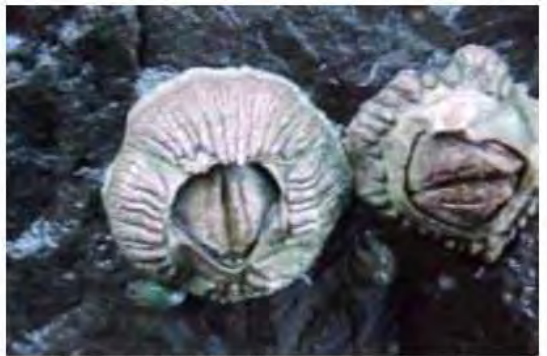
ACORN BARNACLES, Balanus Glandula