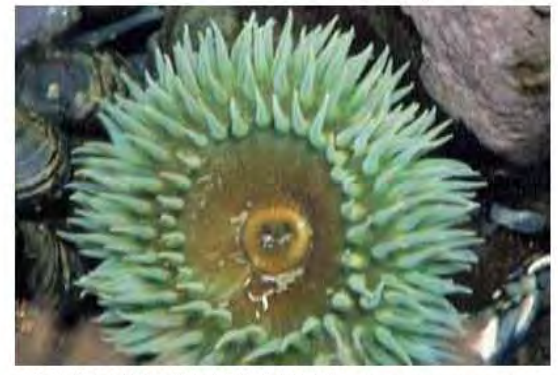
GIANT GREEN ANEMONE, Anthopleura xanthogrammica