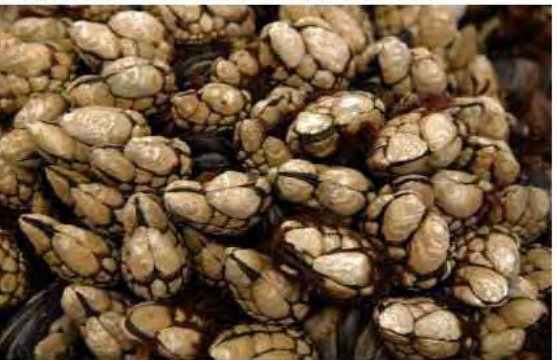
GOOSENECK BARNACLES, Pollicipes polymerus