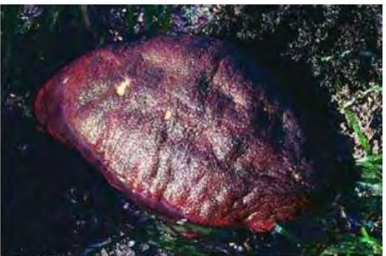
GUMBOOT CHITON, Cryptochiton stelleri