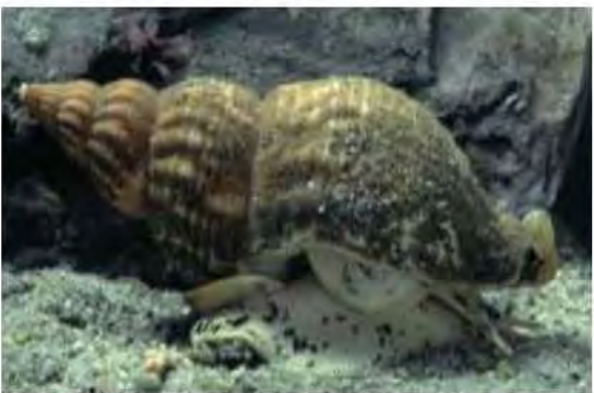
WHELK, Buccinum undatum