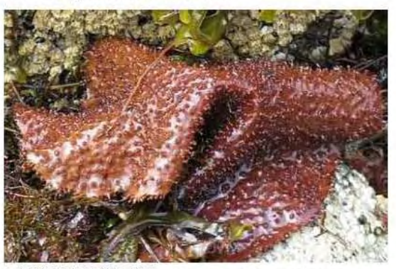
TURKISH TOWEL, Mastocarpus stellatus