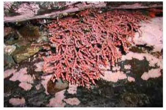
CORALINE ALGAE, Acropora spp.