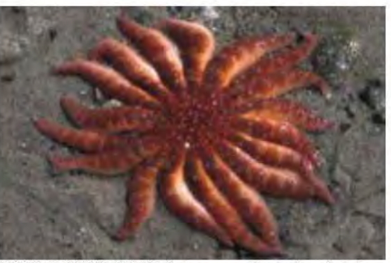
SUNFLOWER STAR, Pycnapodia helianthoides