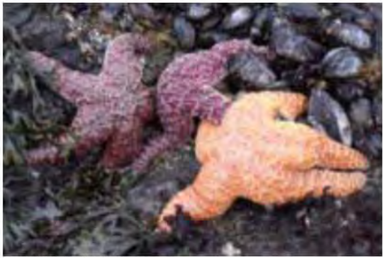
OCHRE STAR, Piaster ochraceus